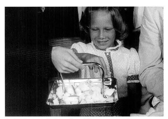
A girl takes a small piece of bread from a sacrament tray. "Take, eat: this is my body, which is broken for you: this do in remembrance of me" (1 Cor. 11:24). Orem, Utah, 1982

The time and setting chosen by Jesus for administering the sacrament among his Jerusalem disciples tie this ordinance to the older observances of the Passover, including the bread and