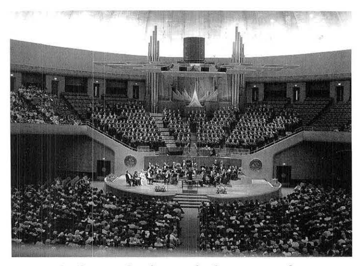
Conference chamber inside the RLDS Auditorium, in Independence, Missouri, with choir and orchestra.

styles and depths of caring ministries not before experienced in the church. The developing Temple School courses and the programs of the Temple Ministries Division have begun to create new life and energy in RLDS branches and members in many of the forty nations where the church is established. Since World War II, the RLDS church has also become much more ecumenical than at any previous time. A resolution passed at the 1990 World Conference requested the First Presidency to go beyond the bounds of the church for help. The specific intent was that the RLDS church would seek those whose experience and expertise would equip them to give valuable help to the forthcoming temple programs in the area of peace and justice.