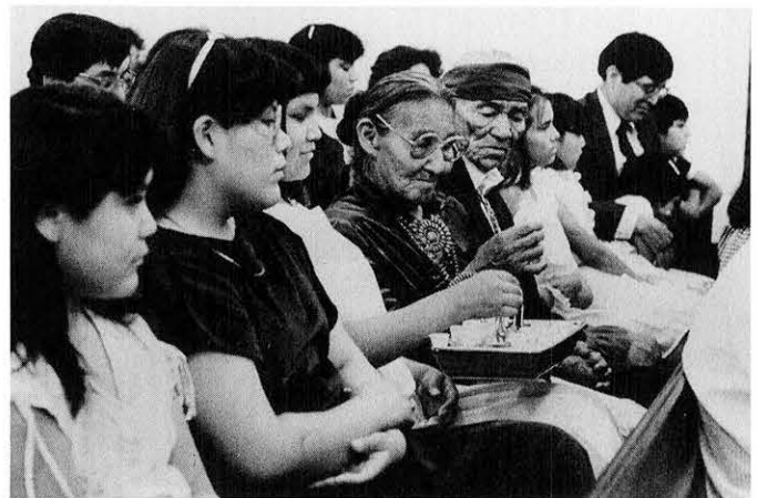
Native American members of the Church participate in a ward sacrament meeting (1985).