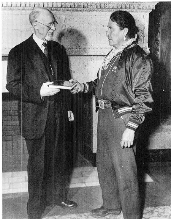
A Native American meets with President George Albert Smith.

An Indian seminary program was initiated to teach the gospel to Native American children on reservations, in their own languages if necessary