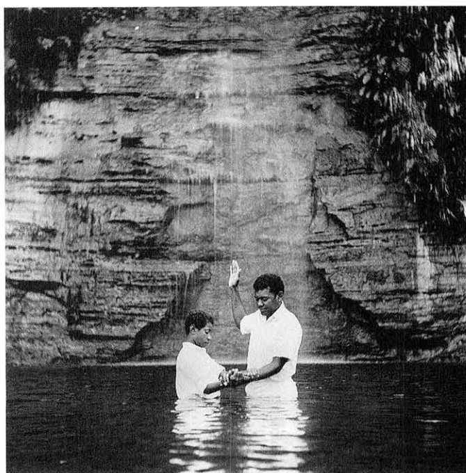
A boy is baptized a member of The Church of Jesus Christ of Latter-day Saints. Jesus said, "Ye shall go down and stand in the water, and in my name shall ye baptize them" (3 Ne. 11:23); "and he commandeth all men that they must repent, and be baptized in his name" (2 Ne. 9:23). A person who is baptized covenants with God to serve him and keep his commandments.

In addition to relying on information in the Book of Mormon, Latter-day Saints follow the New Testament teachings on baptism. Jesus taught that baptism is necessary for salvation. He told Nicodemus, "Except a man be born of water and of the Spirit, he cannot enter into the kingdom of God" (John 3:1–5). He required baptism of those who professed to become his disciples (John 4:1–2). His farewell commission to his apostles was that they should go to all nations, teaching and baptizing