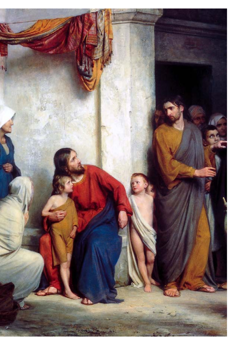
Suffer the Children by Carl Heinrich Bloch.

Girls were not educated beyond learning domestic skills at home, except for rare exceptions. By age five or six, Jewish boys could begin their formal education. However, "90–95 percent of the population of ancient Palestine would have been rural peasants," hence, both boys and girls were often needed to help contribute on the family farms.<sup>9</sup> Even very little ones helped in vegetable gardens, gathering firewood, and with chores.<sup>10</sup>