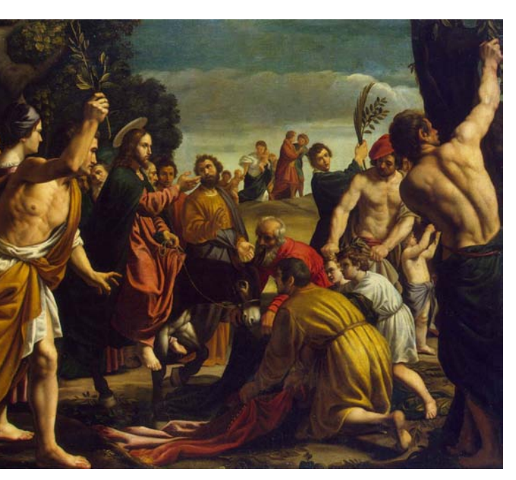
Entry Into Jerusalem by Pedro Orrente.