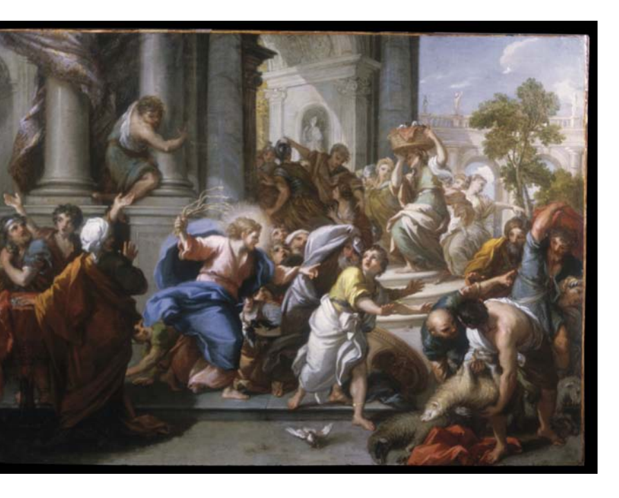
The Cleansing of the Temple by Giuseppe Passeri.

The Temple Courtyard of the Gentiles made up the majority of the 35 acres of the Temple Mount where all were allowed to visit (similar to Salt Lake City's Temple Square). Israelite celebrants could purchase animals necessary for their sacrifices and change their money for the temple coin, which was a Tyrian half-shekel. All financial transactions in the temple had to be in the "Tyrian" currency—including the annual temple tax, sin offerings, vows, purification, etc.