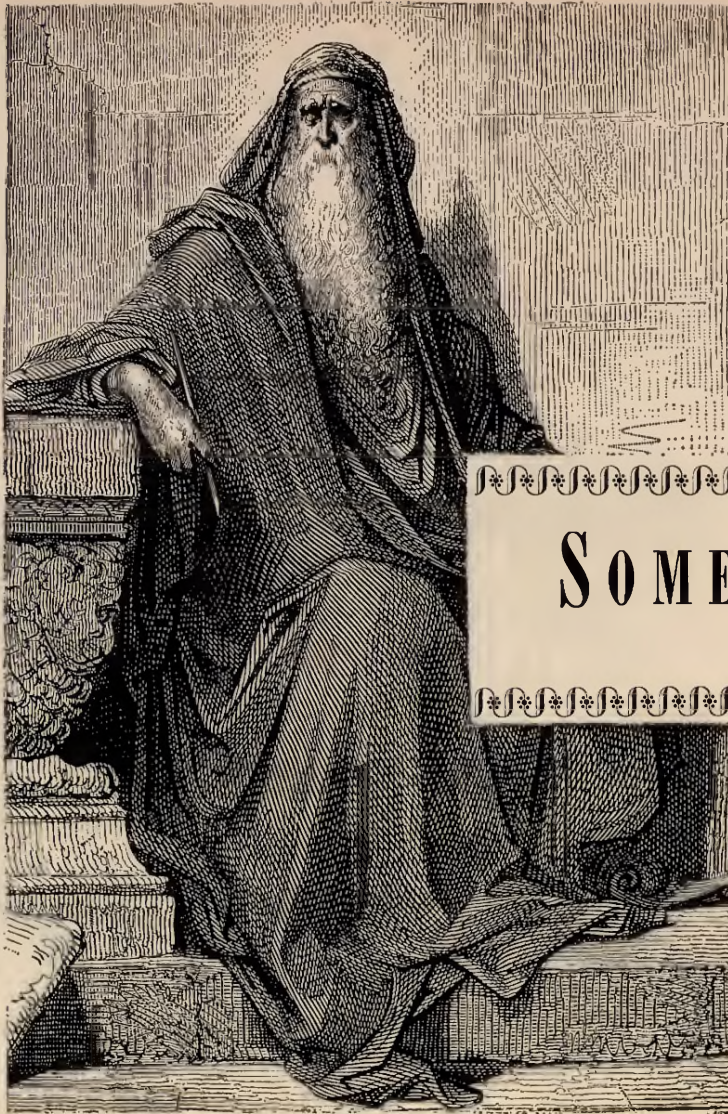
FROM DRAWING BY GUSTAVE DORE

Zedekiah; and also many prophecies which have been spoken by the mouth of Jeremiah.