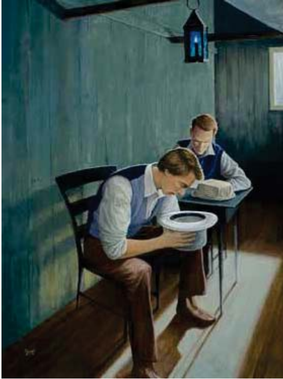
Figure 1. Anthony Sweat, By the Gift and Power of God (2014), online at http://www.archive.bookofmormoncentral.org/content/gift-and-power-god . Used with permission.

contain historical error” (237). As it turns out, the Church actually did try to commission artwork from Walter Rane depicting the translation of the Book of Mormon with the seer stone. However, Rane explained that he wasn’t able to capture the right aesthetic or artistic feel, and the project fell flat (236).