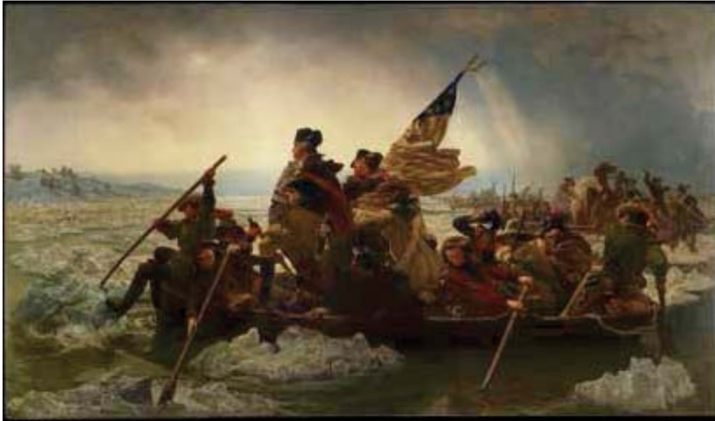
Figure 2. Emanuel Leutze, Washington Crossing the Delaware (1851), online at https://en.wikipedia.org/wiki/Washington_Crossing_the_Delaware . Public Domain.