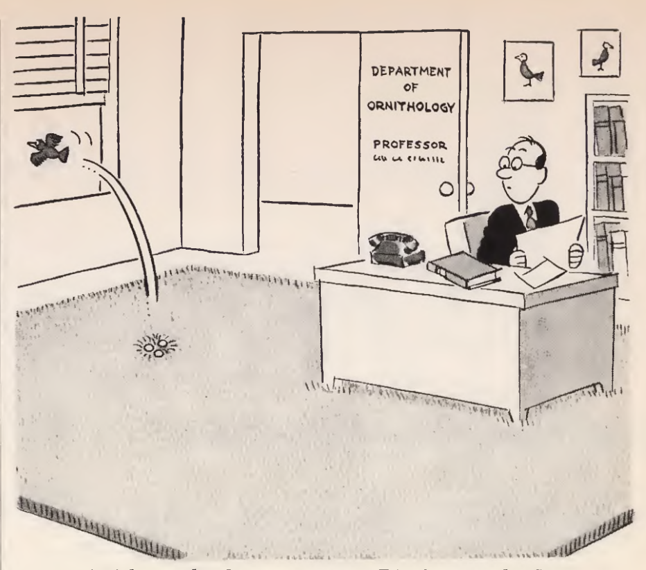
A title on the door \dots rates a Bigelow on the floor

"But behold, and fear, and tremble before God, for ye ought to tremble; for the Lord redeemeth none such that rebel against him and die in their sins; yea, even all those that have perished in their sins ever since the world began, that have wilfully rebelled against God, that have known the commandments of God, and would not keep them; these are they that have no part in the first resurrection." (Mosiah 15:26.)