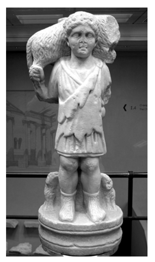
Jesus as the Good Shepherd, Corinth, fourth century, Byzantine & Christian Museum, Athens.

The similarity between these artworks highlights the consistency of artistic representation in the early Christian world. It is interesting that all of these images date to the fourth century, which is when Jerome first connected the parable of the lost sheep with the Good Shepherd passage, and that John 10 makes no reference to the Good Shepherd carrying the sheep on his shoulders as depicted in these sculptures.