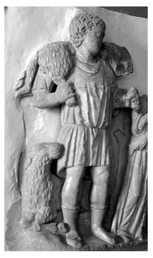
Jesus as the Good Shepherd, Carthage, Tunisia, fourth century, Bardo Museum, Tunis.