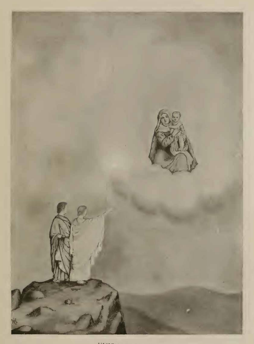
VISION OF NEPHI-