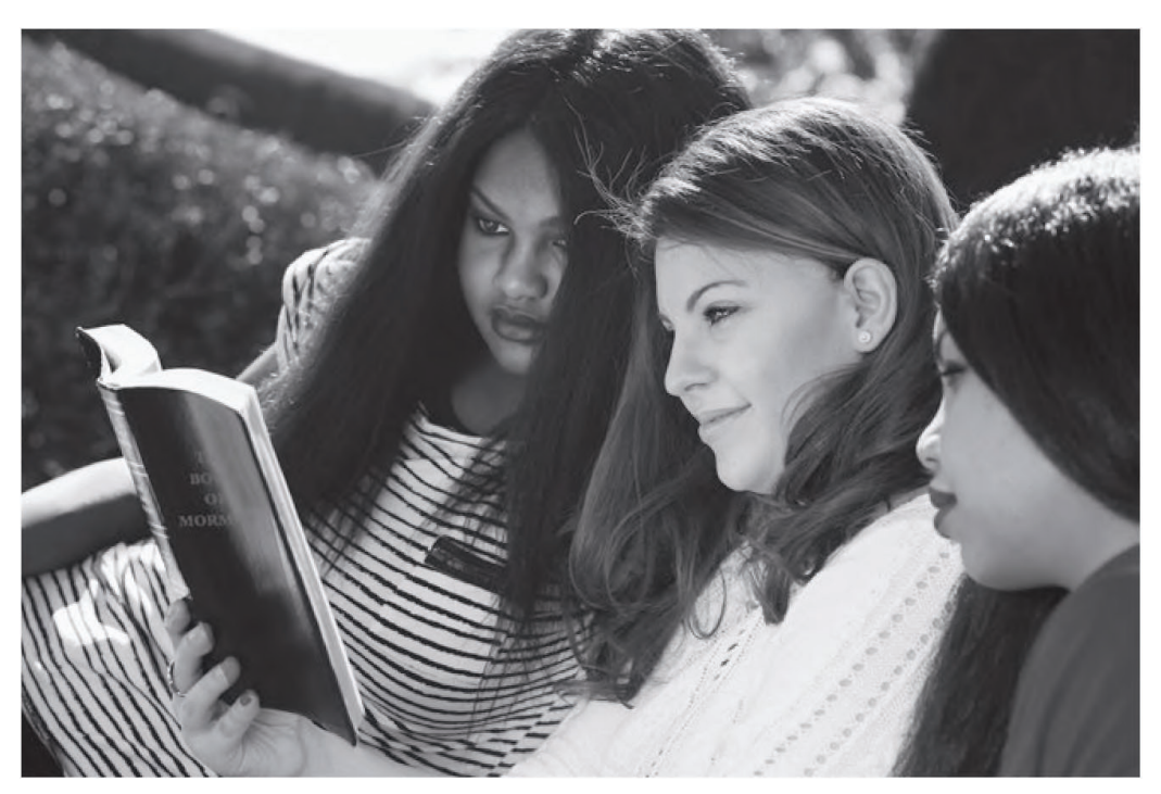
Youth are motivated to read scripture because it makes them feel loved and gives them a sense of peace, comfort, and security.

At one level, contexts can refer to the instructional settings in which literacy and learning activities occur.<sup>13</sup> We might call this instructional environment "activities in context"<sup>14</sup> because it represents a more immediate setting for literacy learning that can include and be informed by social relationships, the arrangement of the physical classroom space, and the purposes of classroom literacy instruction. Activities in context can also include specific instructional activities and the classroom's cultural norms. At another level, contexts can represent the larger cultural and historical environments in which readers, texts, and activities interact to inform motivation for literacy.