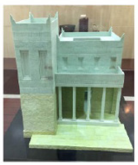
Figure 11. Model of temple at Khor Rori (Khor Rori Archaeological Park Museum) and bronze plate from in the temple (Land of Frankincense Museum).

But what of the statement in 1 Nephi 17:9 about Nephi seeking revelation on where to find ore so that he could make his own tools to build the ship? Doesn't this undermine the proposal that a vibrant community of shipbuilders was already present at Bountiful who could have provided the tools Nephi would need? Why would Nephi have had