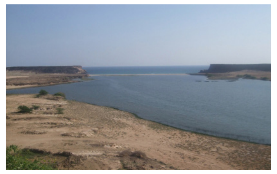
Figure 5. Natural harbor of Khor Rori.

his own building site and dug his own ramp. Excavations adjacent to the ways have uncovered a complete wharf and bollards (wooden post) used to tie up boats.<sup>17</sup> Again, Linehan estimates that Nephi's ship was at least 100 feet long, and further noting that "the draft, the depth of water that a ship reaches when loaded, of Nephi's ship would equal one fifteenth (1/15<sup>th</sup>) the length of the waterline. These are the basic rules which from antiquity to today hold true and are used by modern-day naval architects."<sup>18</sup>