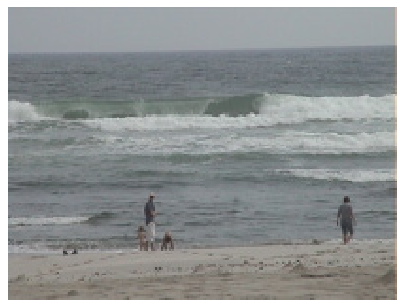
Figure 6. Break surf four miles from Khor Rori.