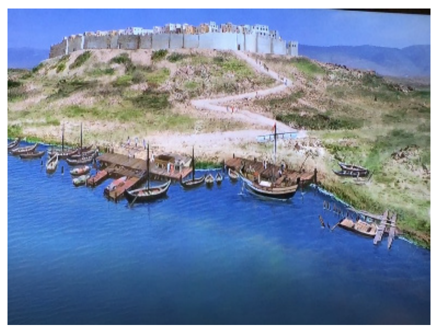
Figure 4. Khor Rori circa 300 BC, from display at the Khor Rori Interpretation Center.

method used by both the Hebrews and the Egyptians.<sup>15</sup> Once the hull was verified as being watertight, the deck and riggings could be added; the ship then loaded with ballast and put to sea for sea trials prior to embarkation. All these maritime fundamentals required a protected shipbuilding yard above the calm waters of a harbor. This has been the case throughout history, even until today. One can travel from San Diego to Anchorage and not find a single shipyard on an exposed inlet or beach.