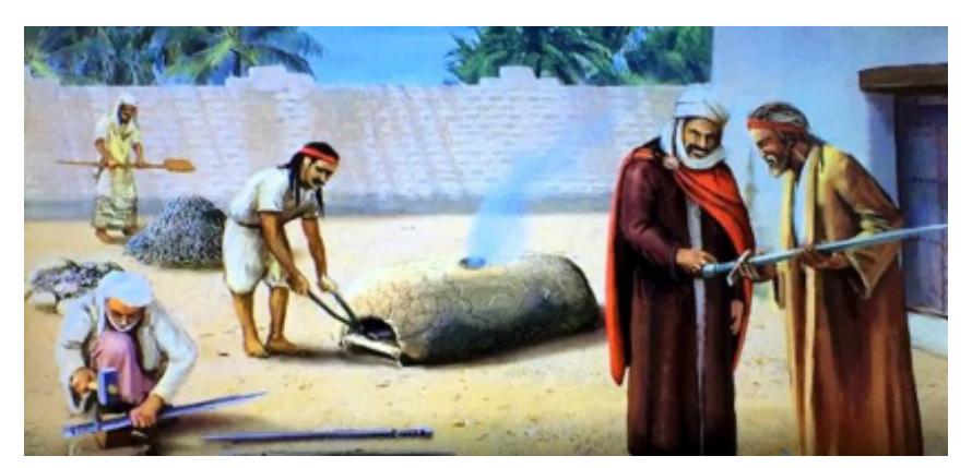
Figure 14. Smelting and sword making at Khor Rori, courtesy of Interpretation Center UNESCO World Heritage Site Khor Rori. Photograph by the author.

from the furnace and hammered ("forged") to squeeze out remaining slag and to weld, or compress, the iron crystals into a solid mass called "wrought iron." Iron produced by this direct process is quite pure (99.5 percent). It is softer and more malleable than good bronze and cannot be hardened by any amount of additional forging. Wrought iron is not suitable for tools or weapons, and added forging drives more slag from the iron, making it even more malleable. Long heating of the wrought iron in direct contact with glowing charcoal, however, causes carbon atoms to diffuse into the outer layers of the iron, creating a simple form of steel (martensite). This process is called "carburizing," and repeated carburizing and forging produce an outer layer of steel that can be very hard and sharpened to a fine edge. The iron is said to be "case hardened," and repeated sharpening will remove the carburized steel. In antiquity, all swords were not created equal. Common soldiers fought with inferior weapons that might dent and bend, but kings wielded swords of special steel, each created by a skilled smith after days or months of hard, hot work at his forge (e.g., Excalibur). The sword of Laban, said to be of "most precious steel" (1 Nephi 4:9), was perhaps one of those special swords. 115