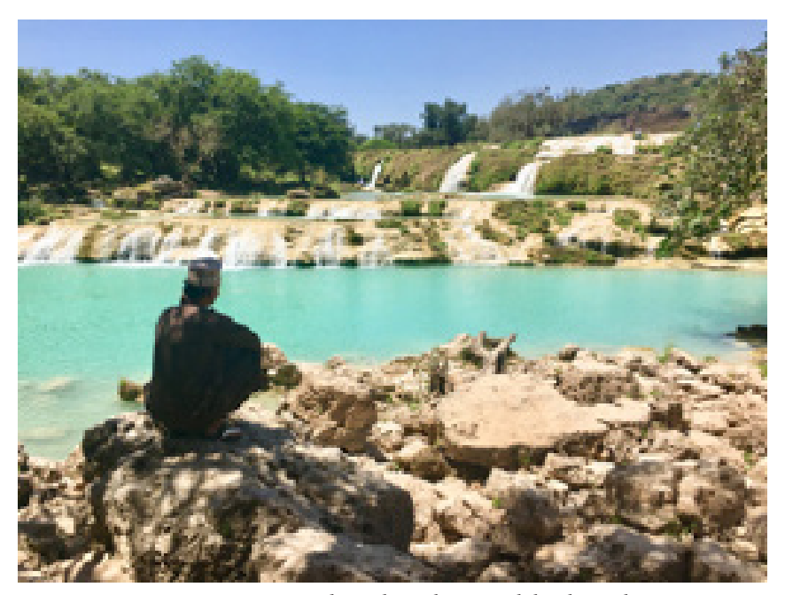
Figure 8. River in Wadi Darbat.

While it is possible that Nephi referred to wild fruits, the young prophet was from the land of Jerusalem, a culture renowned for its orchards, vineyards and its appreciation for fruit (Proverbs 8:19). In describing Bountiful, Nephi distinguished between honey and "wild honey," but only "fruit," not "wild fruit." It is reasonable then that Nephi referred to cultivated crops, and not the wild vegetation that grows throughout the monsoonal region of Dhofar. Near the Bronze Age settlements at Khor Rori are found Iron Age remains of irrigated farms. Zarins notes, "At Khor Rori we found traces of long walls, many at right angles, placed in the context of diverting water from either springs or wadis."24 Nevertheless, we can only speculate on what Lehi would have found at Khor Rori around 587 BC. That said, excavations continue at Khor Rori, and archaeologists have so far confirmed that as far back as the third century BC, the harbor had "traces of irrigation works in alluvial deposits and stone alignments that bordered and protected the arable lands and herding practices. All this archaeological evidence is fully in line with the palaeobotanical and archaeozoological results which point to the population of Sumhuram [Hadhrami ruins at Khor Rori, circa 300 BC] as having a rich and varied availability of food."25