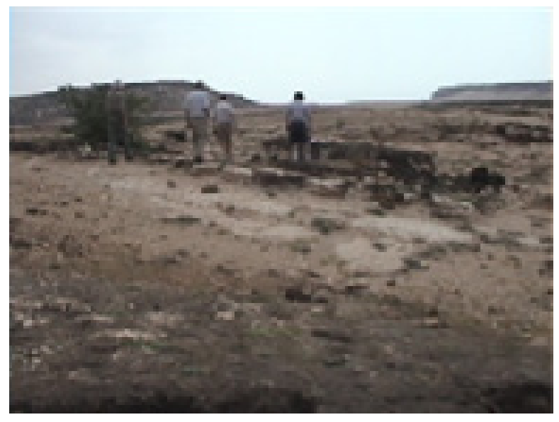
Figure 3. Ancient ways at Khor Rori.