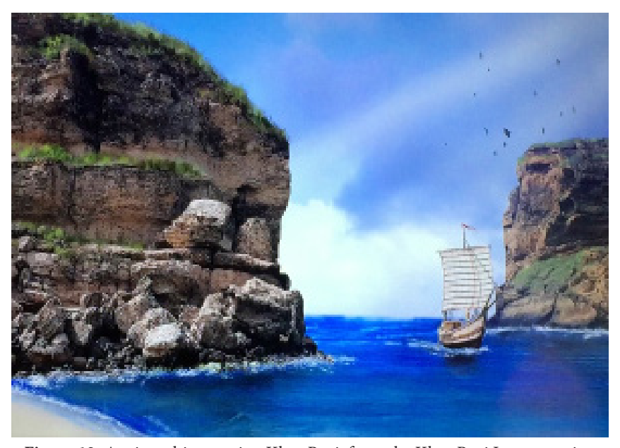
Figure 12. Ancient ship entering Khor Rori, from the Khor Rori Interpretation Center.