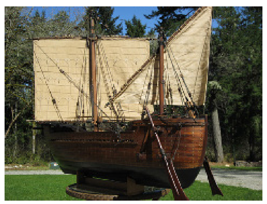
Figure 2. A model of Nephi's ship by Conrad Dickson.

Nephi's vessel as a "ship" (1 Nephi 17:8, 17, 49, 51; 18:1, 2, 4–6, 8, 22). The prophet certainly knew the difference between a ship and a raft. Sailing ships are maneuverable, having keels, rudders, adjustable riggings, and narrow hulls that allow the ships to be sailed in a specific direction. A raft does not have the same capabilities. A brief reminder of the fate of Thor Heyerdahl's raft is enlightening, since it highlights the crew's inability to steer the raft. The journey commenced with the Kon-Tiki having to be towed by a tug into the Humboldt Current, which Heyerdahl knew would drift the raft directly into the path of the islands of eastern Polynesia. When his crew finally spotted an island after 101 days at sea, they tried to steer the raft to the island but could not land because the current pushed the raft farther out to sea." When they approached a second island, the crew could not steer the raft safely. The raft smashed into a reef at Raroia in the Tuamotu Islands on August 7, 1947, and was destroyed.