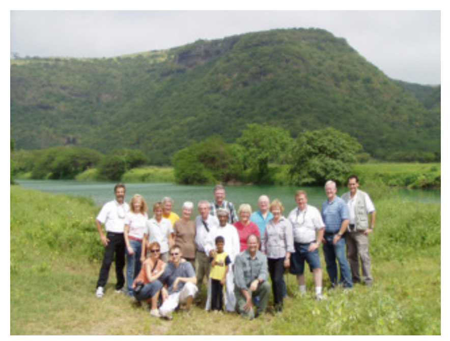
Figure 9. One of five lakes in Wadi Darbat.