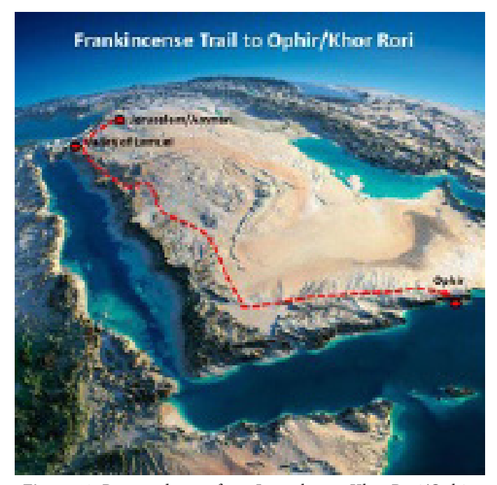
Figure 13. Proposed route from Jerusalem to Khor Rori/Ophir.

So what does Ophir mean? According to Smith's Bible Dictionary (1863), Ophir means "abundance." The same definition is given in Joness Dictionary of Old Testament Proper Names (1990). 110 If you place "Bountiful" in the Microsoft Word Thesaurus, you will find "abundant" as a synonym. Thus, an accurate translation of the name Ophir into English and a possible proper name for Khor Rori is "Bountiful." Potts' Bible Proper Names 111 states that Ophir means "a fruitful region," and we know Nephi named the land where he built his ship Bountiful because of the land's "much fruit and also wild honey" (1 Nephi 17:5). According to Ali, Wadi Darbat has some 400 flowering plants that make its wild honey highly prized. 112