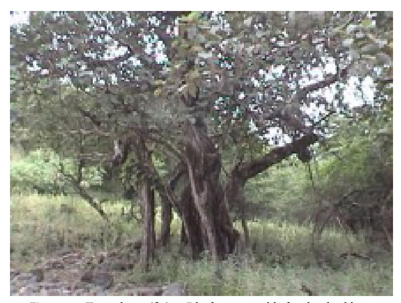
Figure 10. Typical tree (fig) in Dhofar, unsuitable for ship building.

There is no evidence that shipbuilding timber ever grew in Oman, yet Nephi needed long straight hardwood to build a ship strong enough to survive an ocean crossing. Phillips notes in a précis that "Timber appropriate for building a conventional, ocean-going ship does not grow anywhere along the Omani coast and probably did not in the past. Trees are very scarce in the Dhofar, and those of significant size tend to yield gnarly, punky wood."