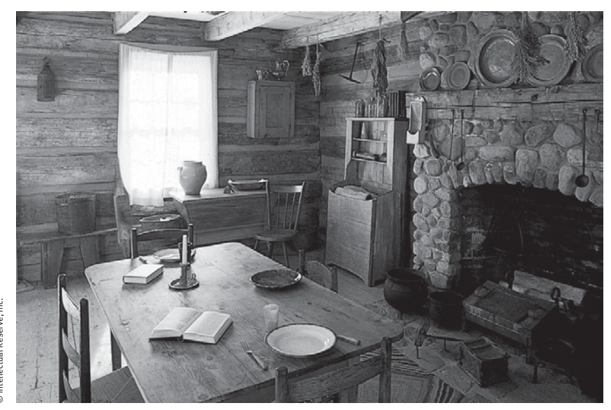
The Whitmer log home was the site of the organization of the Church.

The second conference of the Church was also held at the farm on September 26, 1830. In the order of business, there was "singing and prayer