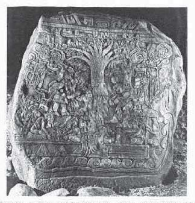
Figure 4. A photograph of Stela 5, Izapa, with tracing and labels as part of the interpretation by V. Garth Norman.

Having considered previous interpretations of Stela 5, Norman saw the need to give the monuments and altars of Izapa the closest possible scrutiny and interpretation.