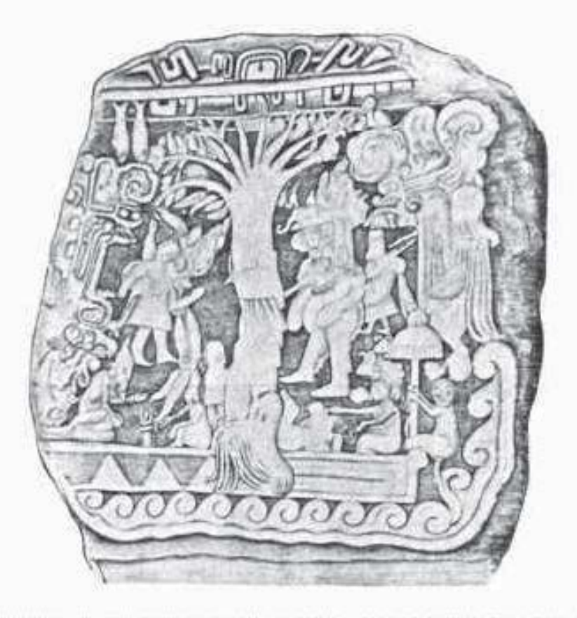
Figure 1. A drawing of Stela 5, Izapa, as part of an interpretation by Clyde E. Keeler.

Miles carried out extensive study of the sculpture of the Guatemala-Chiapas region. An interpretation and drawing of Stela 5 (see Figure 2) follows: