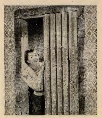
See What MAGIC Unfolds

MAAS CHIMES, Dept. 219, Los Angeles 39, Cal.