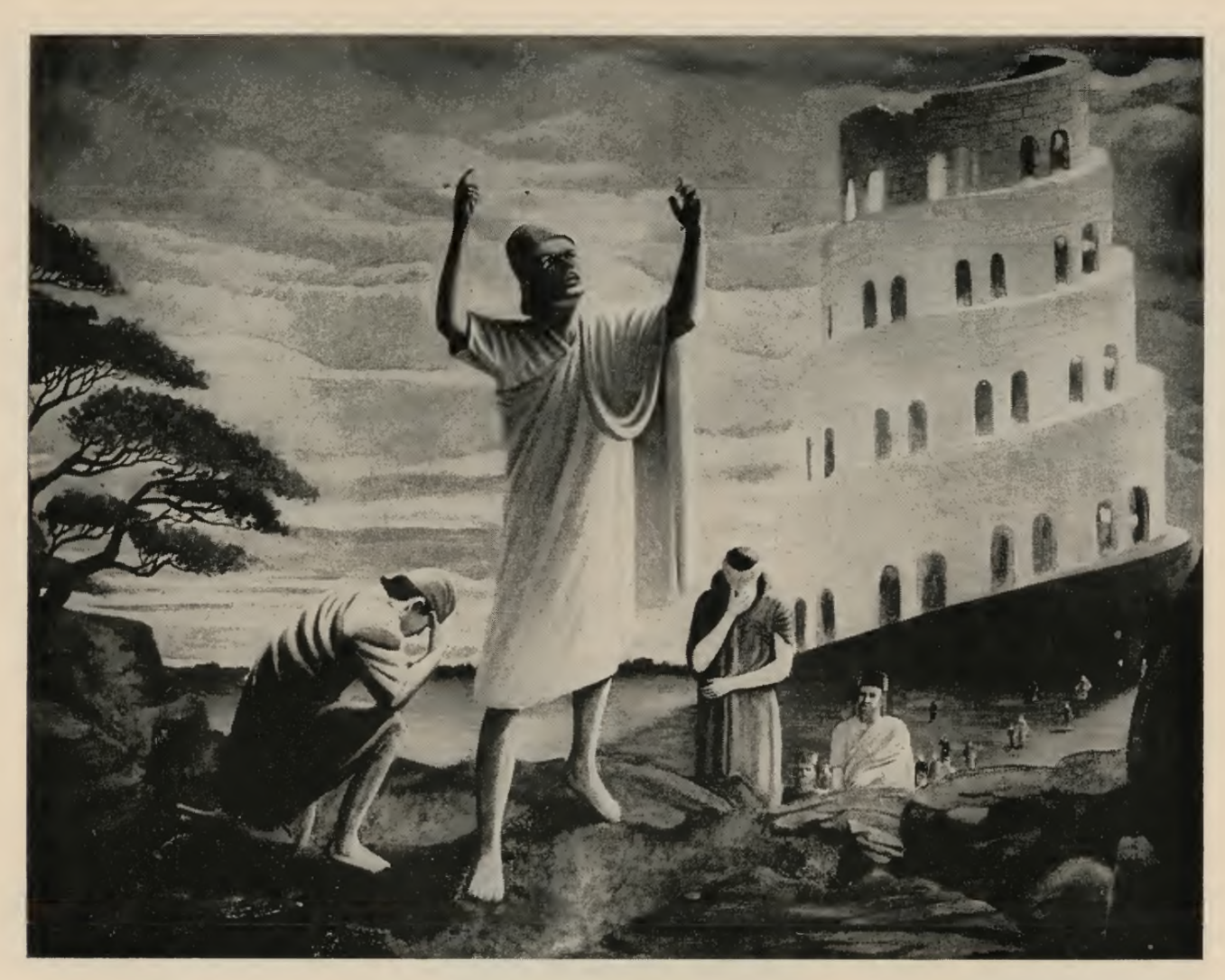
An ortist's conception of the brother of Jored, at the time of the Tower of Bobel, crying unto the Lord that their longuage be not confounded.