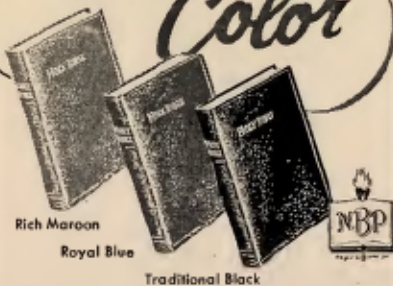
Rich Maroon Royal Blue