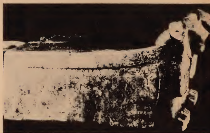
In reference to Fac. No. 1, Fig. 4. "The altar for sacrifice by the idolatrous priests," with the four canopic jars (discussed later): Here is a very ancient Egyptian altar, dating from the III Dynasty. As anyone can see, it is shaped like a lion-couch.