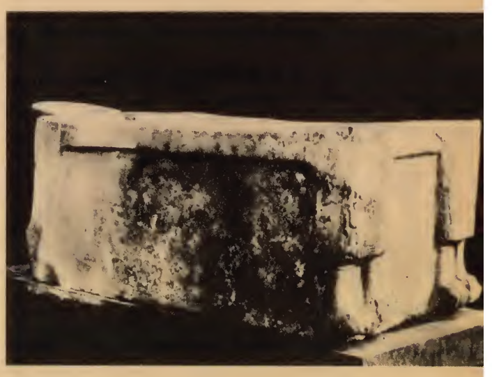
In reference to Fac. No. 1, Fig. 4: Another altar, the head missing but the lion clearly accounted for. It is quite apparent by now that the proper form for an altar of sacrifice among the Egyptians was the lion-couch, as represented and explained in the Joseph Smith Papyrus No. I and Abraham 1:13.