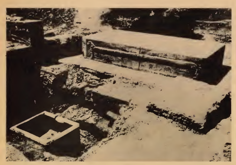
In reference to Fac. No. 1, Fig. 4: Here is a very late Egyptian altar (discovered in 1948), which still faithfully preserves the likeness of the lion-couch.