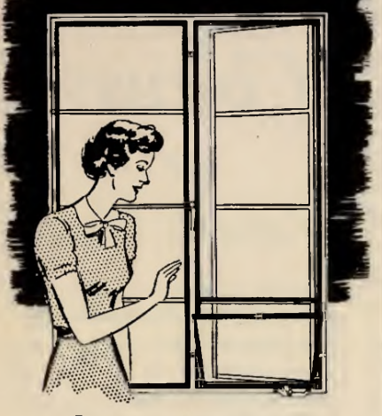
when you specify