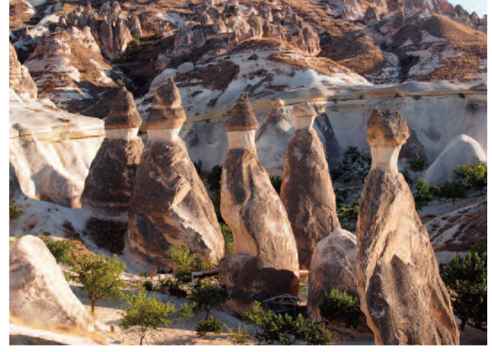
The Göreme Valley of Cappadocia, Turkey

Turkey's varied landscape was always interesting and often stunning, no more so than among the stark geological wonders found in Cappadocia. The highlands of central