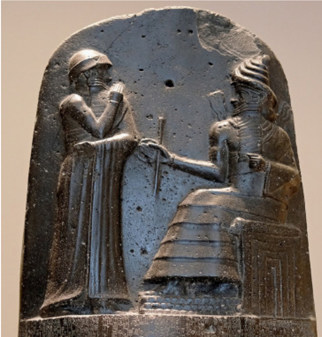
Figure 3. Atop his stele, Hammurabi is depicted as holding his rod (scepter) and speaking his law while his officer raises his right hand. Louvre Museum. “Stele of Hammurabi,” © Mbzt, used under a Creative Commons Attribution-ShareAlike license: http://creativecommons.org/licenses/by-sa/3.0/ .

darkness, he extends his rod and invites everyone to hold fast to that word, accept his covenant rule, and spread his message. As his covenant saints scatter across the earth — though they are few — the Lord arms them “with righteousness and with the power of God in great glory” (1 Nephi 14:12, 14).