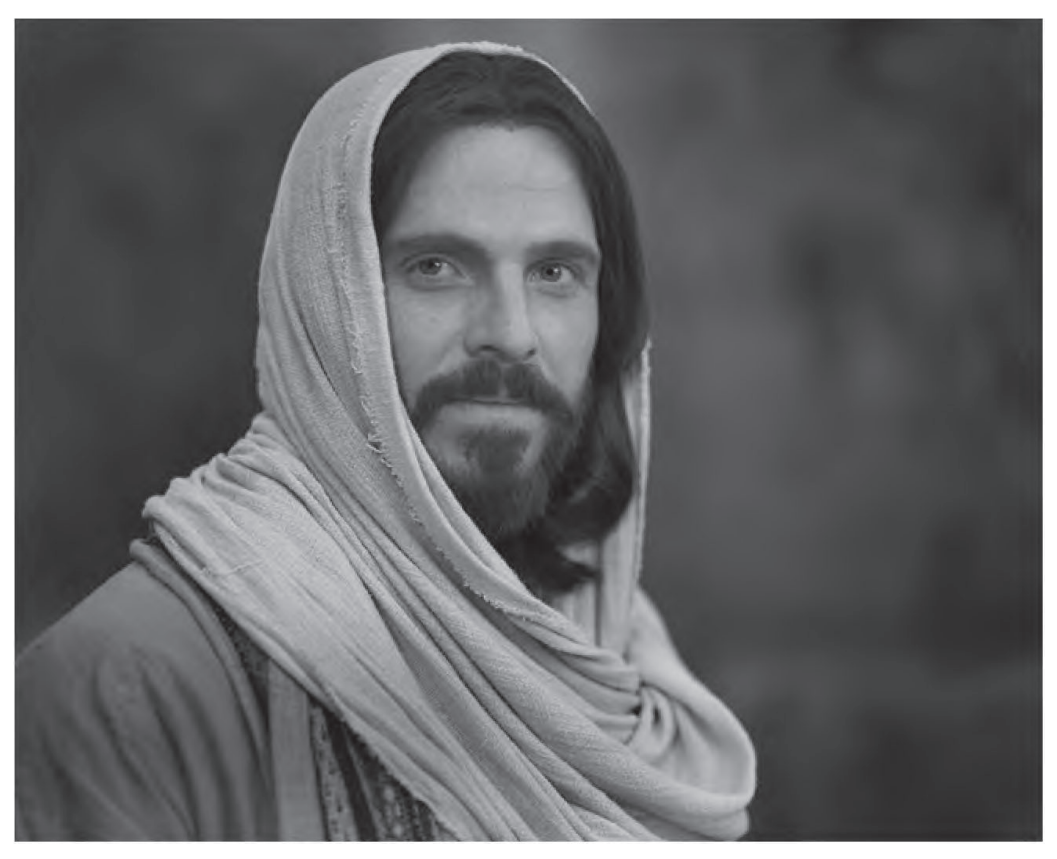
How do we determine when we have done enough, or our "best," in order for Christ to do the rest?