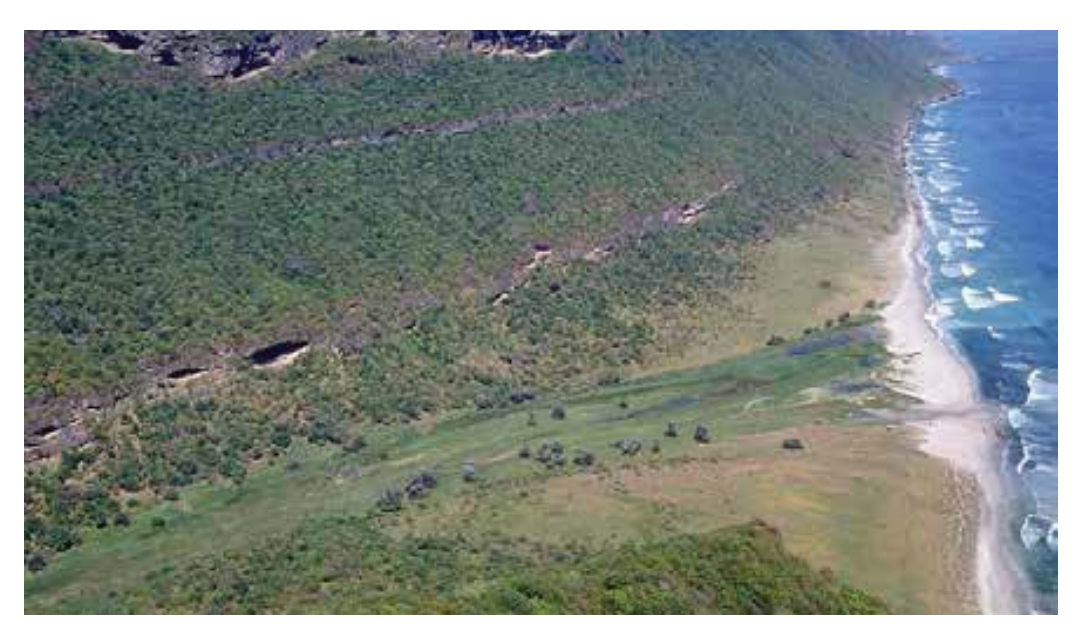
A view of Khor Kharfot at Wadi Sayq, facing eastward. Photo taken after the monsoon season when the area is especially green.

In contrast to Joseph's vague summary of Lehi's journey mentioned above, the Book of Mormon text provides a number of specific details: three days through the wilderness past the borders "nearer" the Red Sea to the Valley of Lemuel, which has a continuously flowing river, and