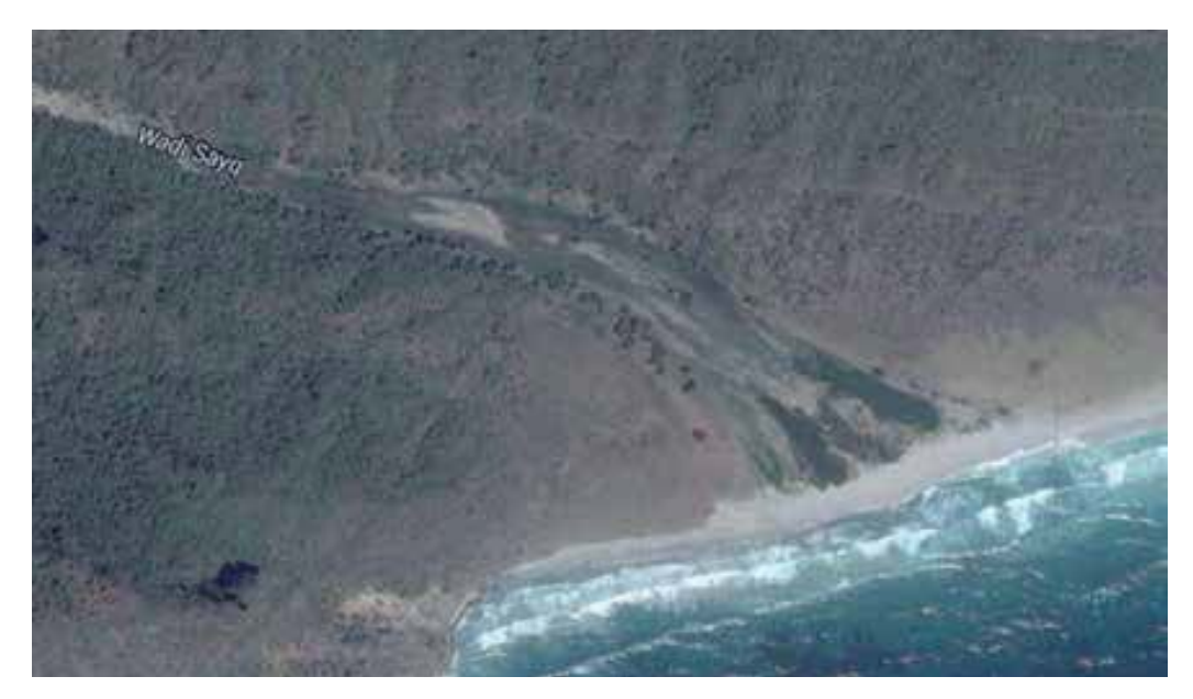
Satellite view of Wadi Sayq at Khor Kharfot, showing the large freshwater lagoon at the leading candidate for Bountiful, nearly due east from Nahom. Note: this Google Earth image was taken in the dryer winter months and thus lacks the vibrant green that follows the monsoon season.