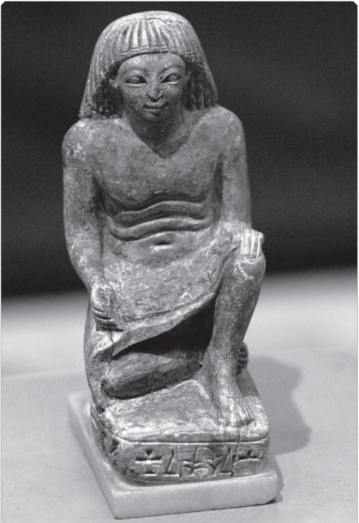
Artist unknown, located in the Louvre Museum, France

In ancient Egypt, sitting on a chair, as opposed to sitting on the ground or on a stool used by a worker, meant you were important, because the chief role of furniture was to signify status. The chair represented nobility both in practice and in communication.