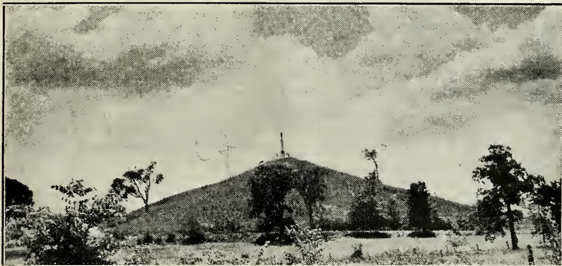
The Hill Cumorah