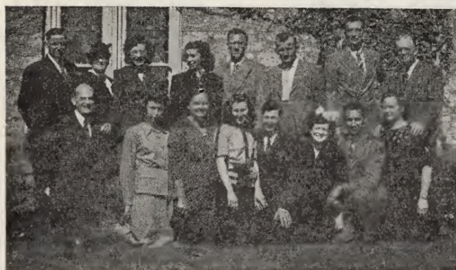
A group of conference visitors from Spokane, Washington.

When I was about eight years old I start to heard sheep, and from that time on I have learned lots about God's work. I was a lonely boy. My brothers and sisters were big. When my father died in 1911 I was left alone with my mother, and she also encourage me to remember my father's last words—told me to live right and pray morning and evening so I keep it up. But sometimes I think of myself if I was worth to God, then with a humble heart I look toward east where Sun rises. I would then