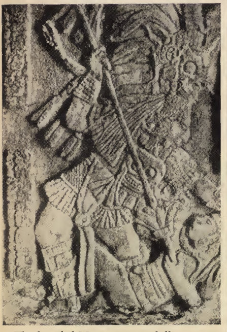
The bearded Mayan warrior killing a captive. Under surface of west door lintel, "Temple of Painted Walls," Bonampak, Mexico.

Not only do we have the likeness of this bearded white person carved in stone, but we also have the definite claim made by Ixtlilxochitl that the Toltec kings, including Topiltzin, were white and bearded. To quote: "These kings were high of stature, and white, and bearded like the Spaniards, ...<sup>31</sup>