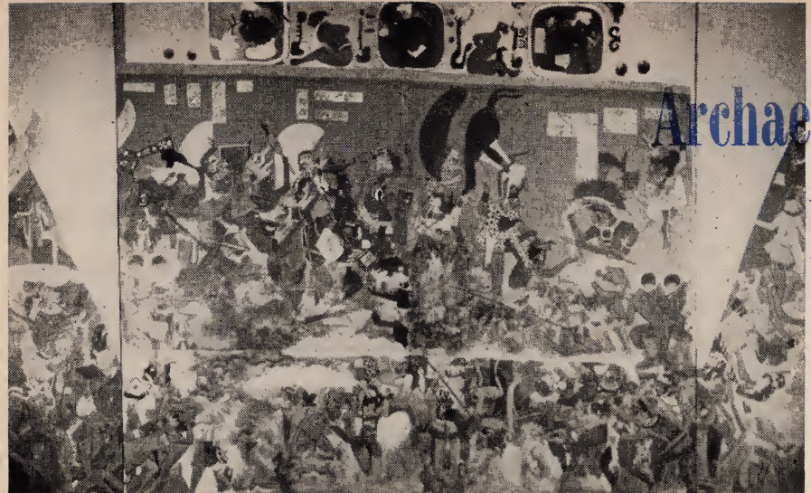
White and dark peoples. Reproduction of mural from inner wall, "Temple of the Painted Walls," Bonampak, Mexico.