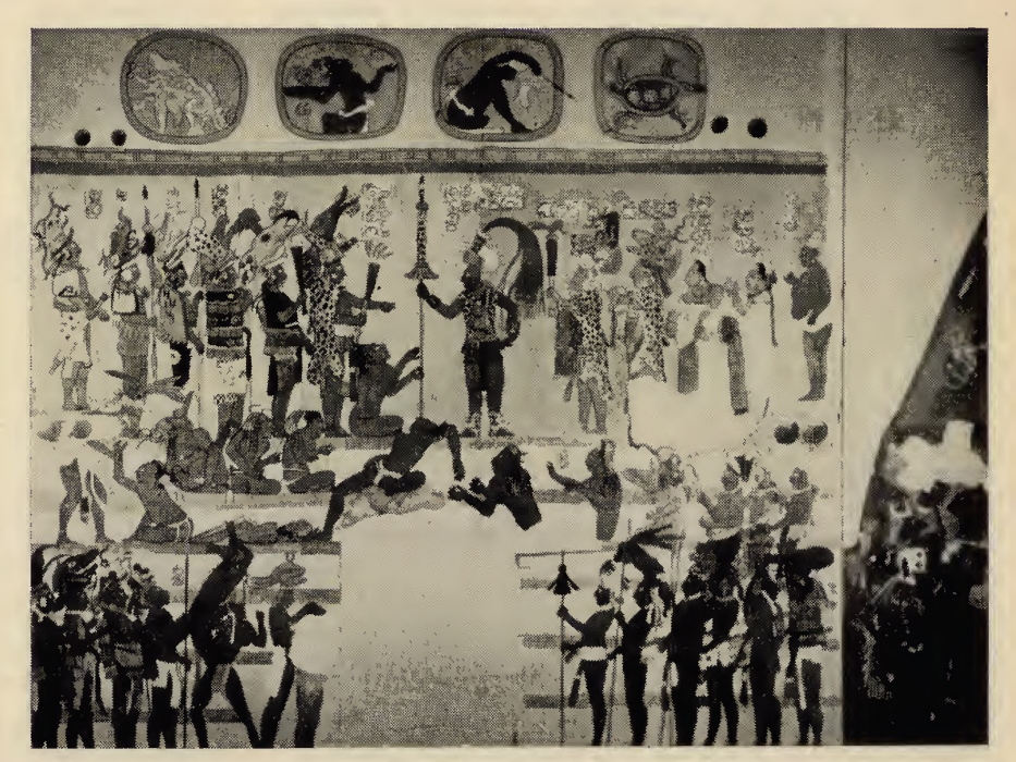
Reproduction of a mural depicting white and dark peoples, from the inner wall, "Temple of the Painted Walls," Bonampak, Mexico.