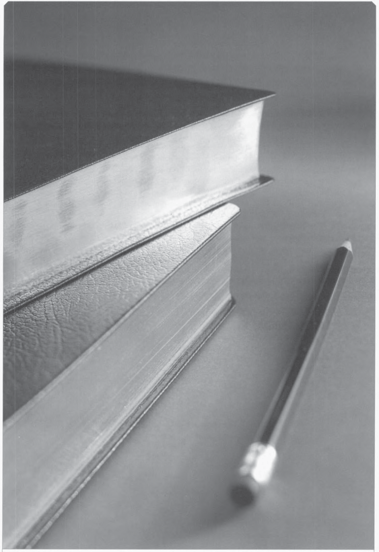
The term religion appears only five times in the New Testament, and the Book of Mormon offers a unique window to show the development of religion.