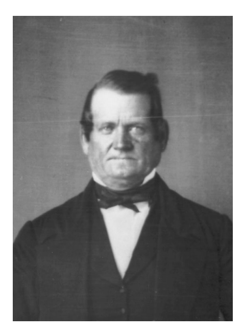
Orson Hyde.

Although the case itself began on December 21, 1833, events occurred nine months earlier that set it in motion. In March 1833, the newly baptized Doctor