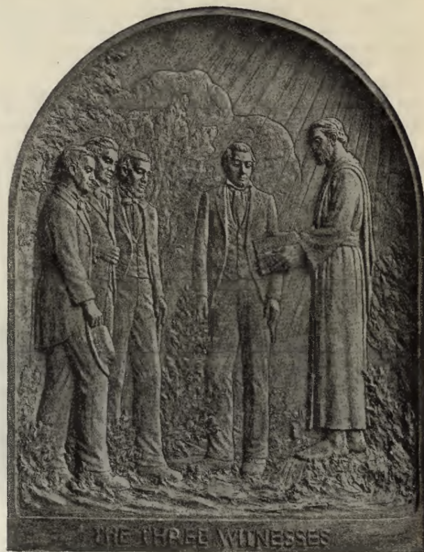
A LOVELY PANEL OF THE HILL CUMORAH MONUMENT BY TORLEIF KNAPHUS

A Rochester paper printed the history of the Church in four instalments, gave detailed accounts of the unveiling, and illustrated them well. Another paper featured a full page of Mormon pictures and story. New picture postcards of the monument were a treat to travelers who wanted a memento for home folks.