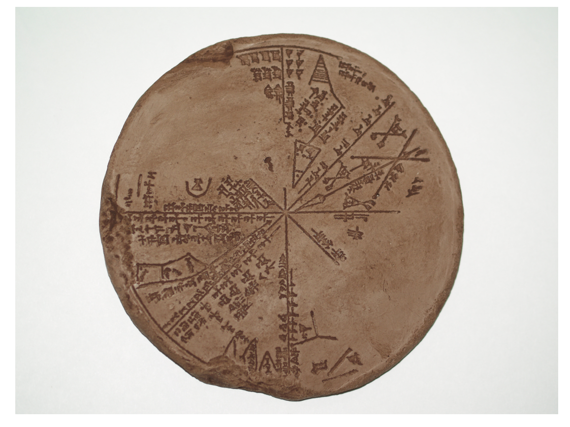
Figure 19. Sumerian planisphere from Mesopotamia (replica).

The Sumerians were sophisticated astronomers. A circular cuneiform stone-cast clay tablet was recovered from the 650 BC underground library of King Ashurbanipal in Nineveh, Iraq, in the late 19th century by Sir Henry Layard. According to researchers, this clay tablet is believed to be a planisphere (star map), one of the earliest astronomical instruments discovered in Mesopotamia. Computer analysis matched the inscription on the tablet to the sky above Mesopotamia on June 29 in the year 3123 BC (see figure 19). Interestingly, this date is close (though perhaps unrelated) to the base date of the Maya Long Count calendar: August 11, 3114 BC.