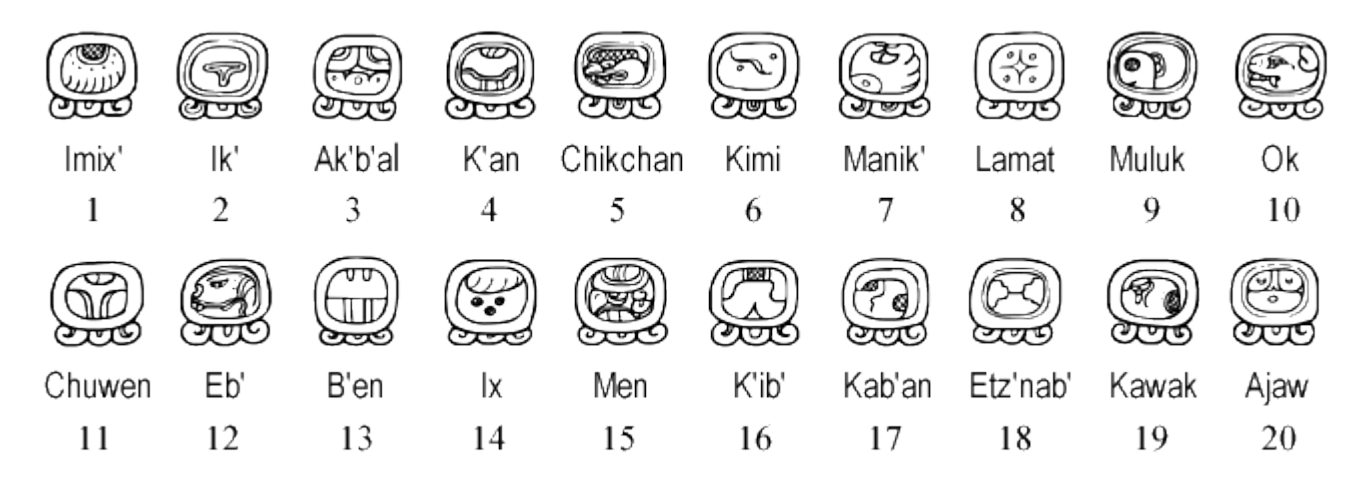
Figure 17. Maya day glyphs. (www.mayan-calendar.org, 2017)

In addition, the day glyphs are not written phonetically but are logographs independent of any particular language. In the Classic Maya, the day glyphs always appear in a cartouche, which is indicative of a glyph for "20," or in a container such as a jar, gourd, or bag (see figure 17). Some of the cartouche have small, curled foot-like pedestals (Houston 1989, 35).