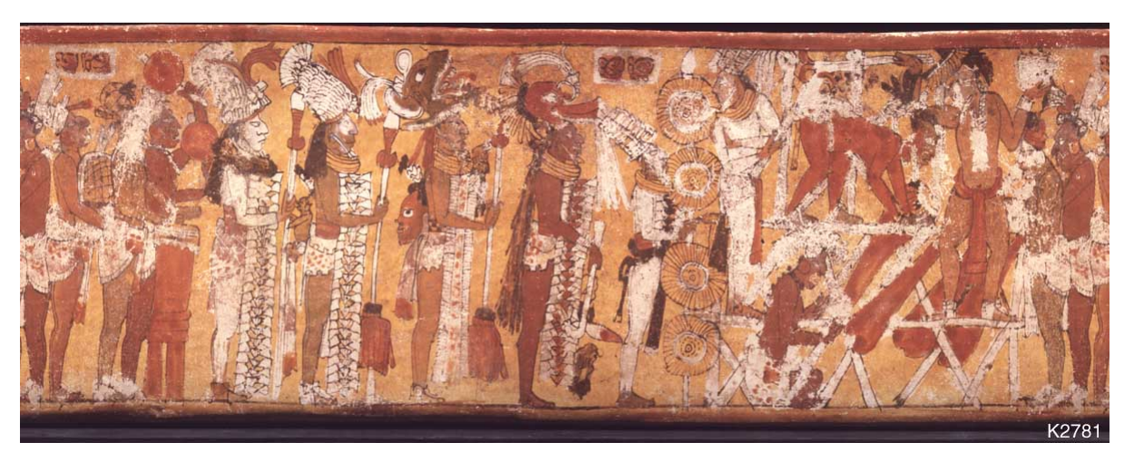
Figure 4. Scaffold Vase depicting deer-man sacrifice (Kerr, 2016)

The deer-man sacrifice is depicted on what Taube (1988, 333) refers to as the Scaffold Vase (with Kerr identifier number K2781) in the Dumbarton Oaks Collection (see figures 4 and 5). The victim has hair pulled up in the form of antlers. There are flanking attendants holding lances, which in other Mesoamerican depictions were utilized to spear the flesh of the victim. Another detail on the depiction is the burning of the deer-man's back cloth.