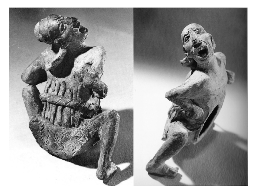
Figure 7. Campeche figurine showing captive to be burned with faggots strapped to his back (Schele and Miller 1986, Pl.94)

Similar to burning the deer-man's backcloth, a Campeche figurine with a bundle of faggots on his back (see figure 7) indicates that victims were burned to death or tortured by burning during the Classic period by method of strapping faggots to their chest and lighting them on fire (Henderson 2013, 177).