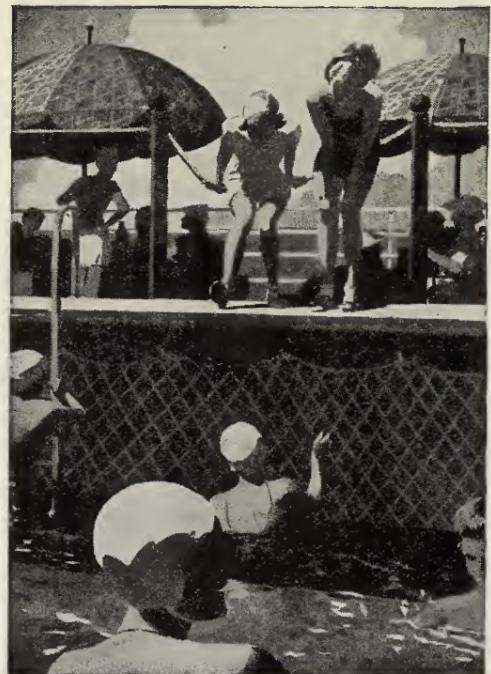
New! "Flamingo Beach" pools . . . swim, suntan, loaf under colorful beach umbrellas

DOuglas 8680 — 665 Market Street, San Francisco. American Express Company, 26 W. Second South Street, Salt Lake, or any Railroad Agent