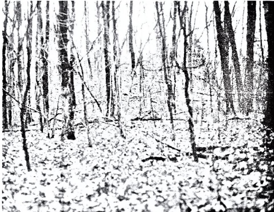
Naples-Russell Mound Number 8, Pike County, Illinois, where Zeph was found

Photograph, taken March 1989