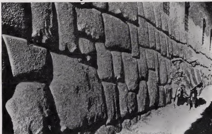
PRE-INCA WALL: ROADWAY IN CUZCO, PERU

In the country once governed by the Incas, tumuli are of frequent occurrence. They are sepulchres, called "Chulpas" by the natives, the depositories of much of the riches and treasures of the deceased. These burial tombs consist of a stone casing usually from fifty to sixty feet high. About a mile and a half south of Lima is one nearly two hundred feet high. It appears most probable that the bodies of deceased chieftains and other persons of consequence were buried in the "Chulpas" and that those of ordinary individuals were deposited in common graves. Note the perfection and strength with which the masonry is constructed by the seams not coming together. The crack in the stone work near the top seems to be due to earthquakes, which are prevalent in this region.