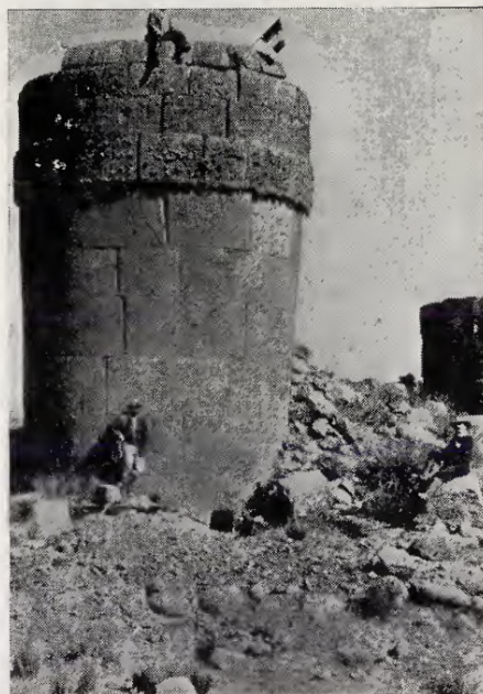
SILLUSTANE, PERU. "CHULPAS" OR BURIAL TOMBS

The walls at Cuzco are built of stones of great magnitude, having seldom less than from six to nine angles; yet they are so closely and firmly joined that the interstices almost escape detection. Some of the walls are constructed with two casings of stone and the interval is filled up with pebbles and a mortar of clay, the whole forming a mass almost equal to stone in hardness. Note the double doorway of different size in this particular picture, with the extra long stone forming the top of the outer entrance.