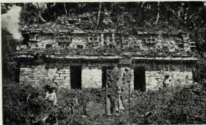
PALACIO EN TAXCHILAN CHIAPA

Excavations inside the pyramid-temple at Copan disclosed a sepulchral vault, more than six feet high, ten feet long, and five and a half broad, and flanked by two niches which, as well as the floor of the vault were full of red earthenware dishes and pots, many of them filled with human bones packed in lime. The floor of the vault was constructed of solid stone, coated with lime, and was strewn with fragments of bones. Among the articles found in this chamber were several sharp-edged, pointed knives of chuya, stalactites, marine shells, and a small death's head carved in fine green stone.