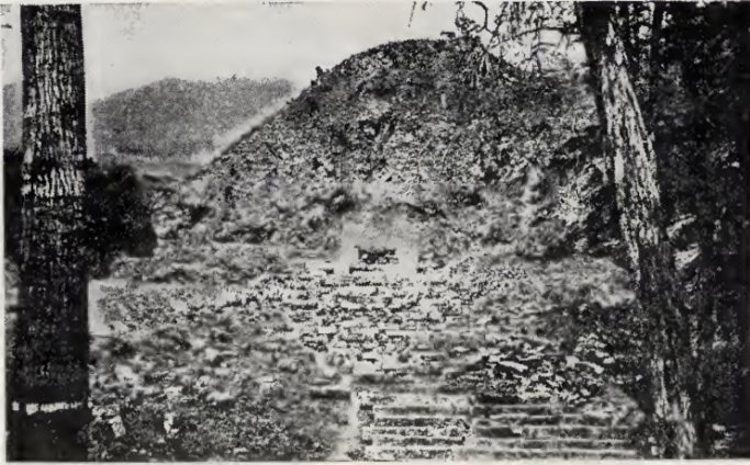
LA PIRAMIDE, COPAN, HONDURAS

Two hundred yards broad from east to west, this gigantic temple in Copan on the northern bank of the river, is almost as large as the great Egyptian pyramid of Gizeh, there being a difference of only eighteen feet. Its base appears to have been an elevated terrace, accessible from the exterior on three of its sides by stone steps. Until recent years, most of this extraordinary structure was in almost complete ruin, but as the result of reconstruction, it appears today in almost the same state of grandeur as originally.