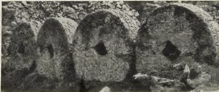
THE GREAT STONE WHEELS OF THE PRE-INCANS

Long ago the Chimus, a people antedating the Incas, built their great capital of Chan-Chan near the site of the present-day Peruvian city of Trujillo. Although its walls have endured time's assaults for countless centuries, they are fast crumbling now, especially from the action of repeated floods on their adobe structure. From the air, one can obtain the best idea of the once vast extent of the city and trace, even indistinctly, the remains of what once were its temples, palaces, plazas, gardens, and reservoirs. The material used in the building of Chan-Chan was of a hardened substance about half adobe and half cement. Late explorers have, in uncovering and cleaning the walls, found carvings like those on the building of Metla Oaxaca, Mexico, also carvings of the feathered serpents like those of the great cement city of Teotihuacan, twenty-eight miles from Mexico City. 250,000 people lived in Chan-Chan.