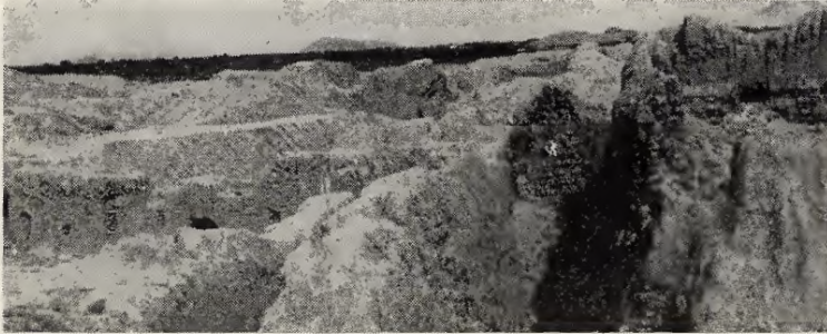
CHAN-CHAN, THE CAPITAL CITY OF THE CHIMUS

Publishers of "Buried Empires of South America" and "Grandeurs of Ancient America."