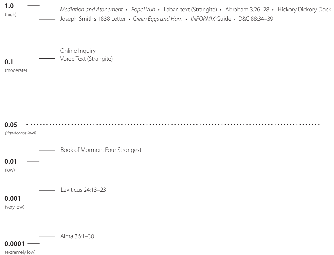
Figure 1. Graph of Overall Likelihoods P That Chiasms Could Have Appeared by Chance