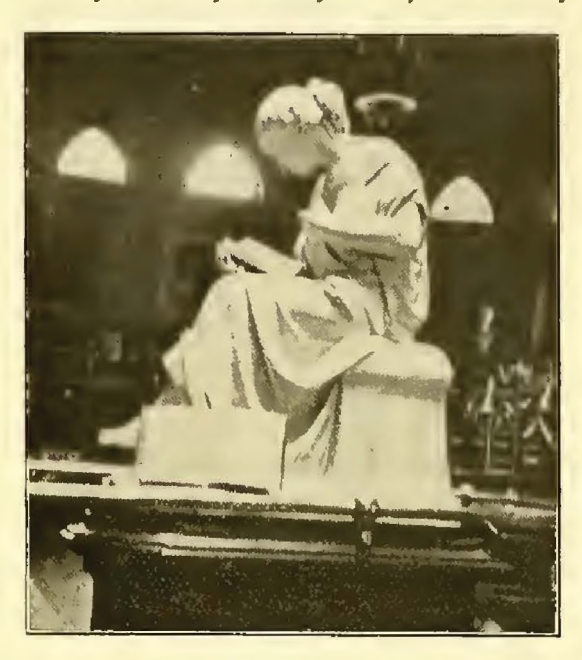
READING ROOM, OBERLIN COLLEGE, OBER-LIN, OHIO.

in works of art & inginuety,—I hapned to tread on a flat Stone. This was at a small distance from the fort: & it lay on the top of a small mound of Earth exactly horizontal—the face of it had a singular appearance I discovered a number of characters which appeared to be letters but so much effaced by the ravages of time, that I could not read the inscription. With the assistance of a leaver, I raised the Stone, But you may easily conjecture my