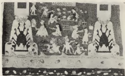
A TEOTIHUACAN CEREMONIAL SCENE—ABOUT 800 A. D.