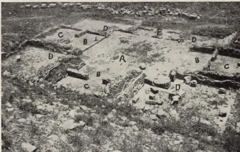
THE FLOOR PLAN OF A PRIEST'S HOUSE