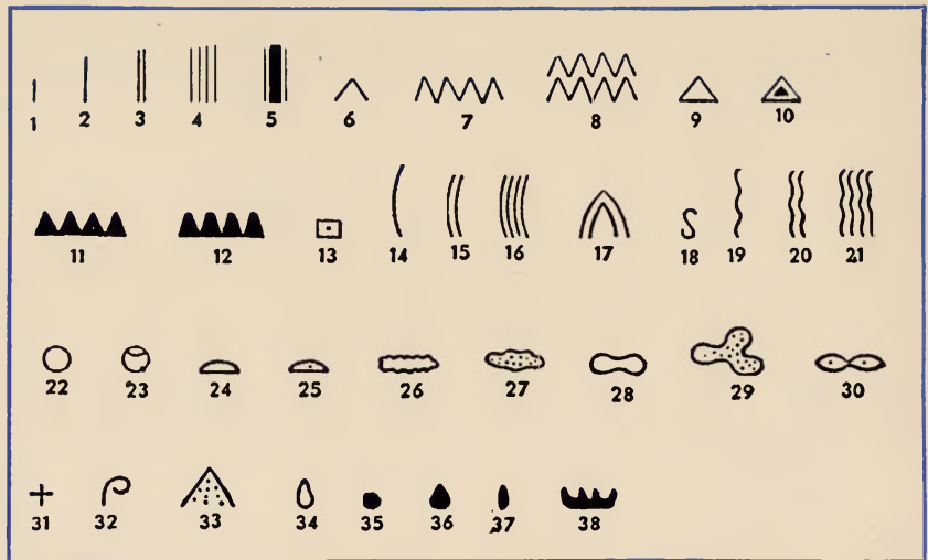
Fig. 3. The essential strokes and curves constituting the basic script upon which the Mayan glyphs may have been made.

The Book of Mormon, illustrated by the Anthon Transcript, stands alone, a lighthouse in the darkness proclaiming that source to be in Egypt, and explaining the means by which that ancient, sacred script came ultimately into these alien lands.