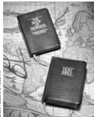
Grant Heaton, © 1986 IRI

true,’ providing they are honorable witnesses. Here the Lord applies the law to nations. Why should it not be so?”