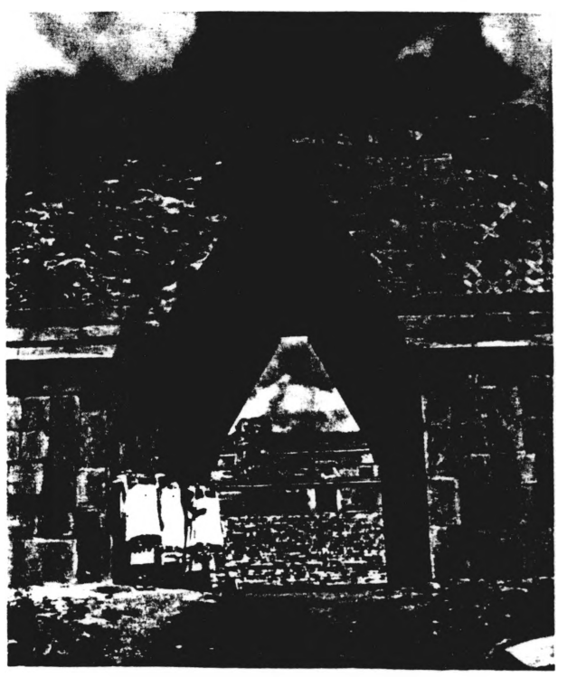
Entrance to the Nunnery, Uxmal