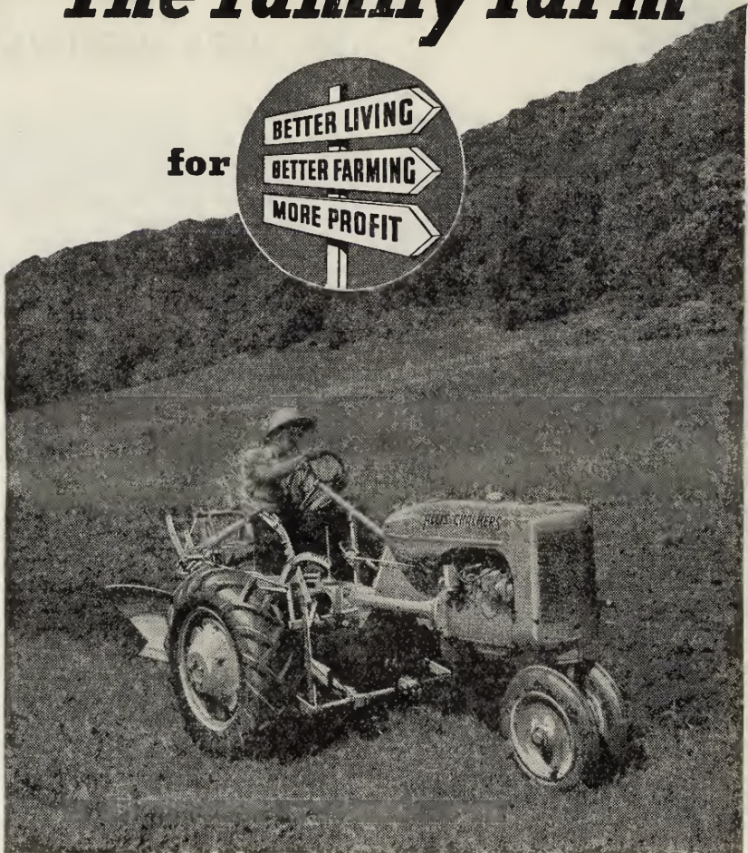
Above—Lapping furrows uphill with 2-Way Pick-up Plow

AT Allis-Chalmers we believe in the farm as a way of life . . . in family-operated farms!