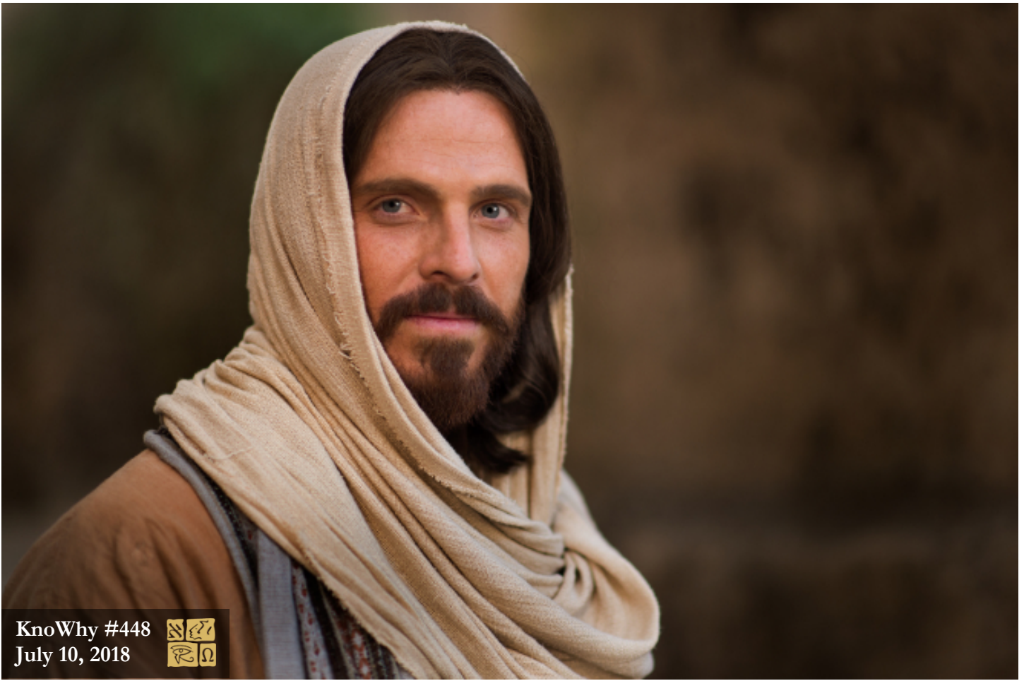
Image of Christ