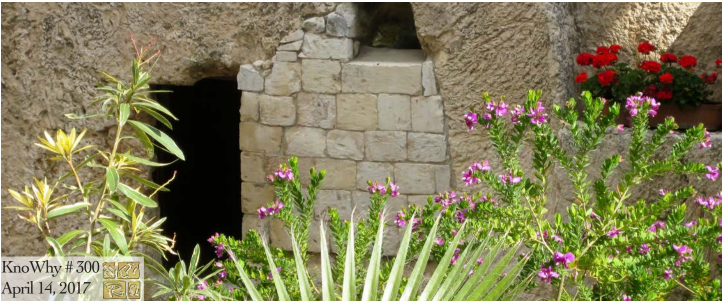
Entrance to the Garden Tomb