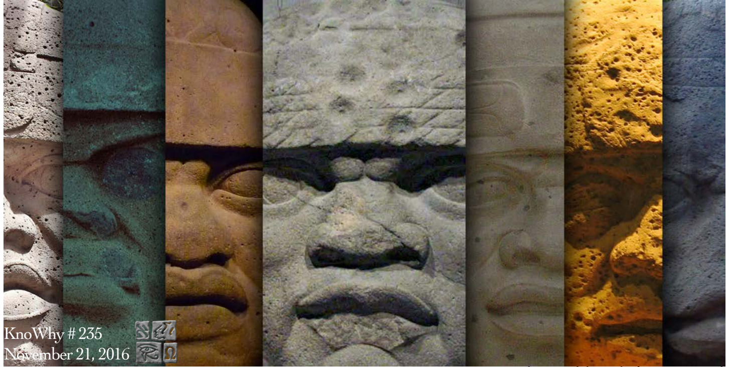
Olmec Heads by Book of Mormon Central