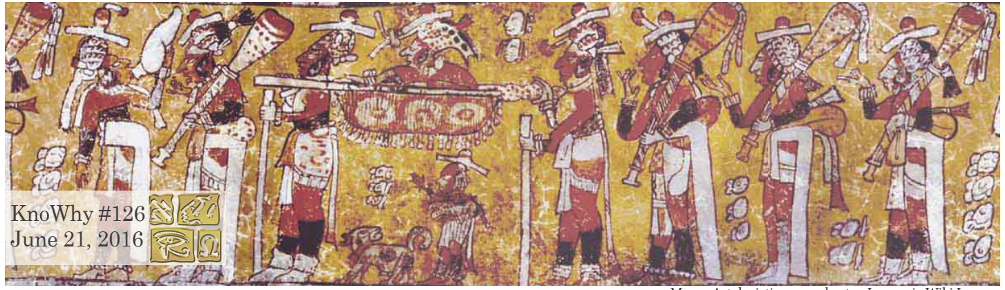
Mayan Art depicting a royal entry.