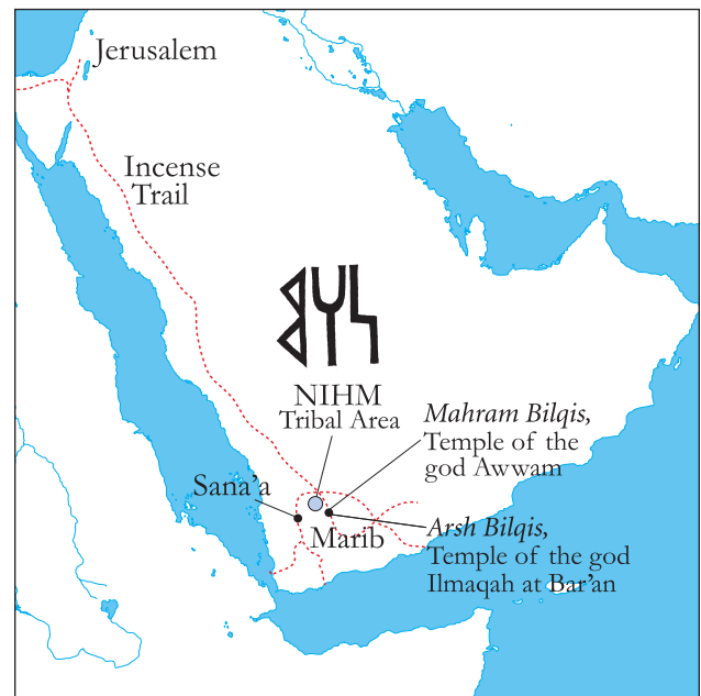
The distance from Jerusalem to the Nahom region and the nearby city of Marib is approximately 1,400 miles.

ences to it in the Old and New Testaments, the Talmud, and the Qur'an. 7