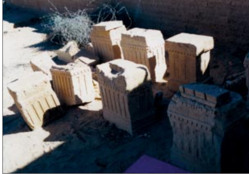
Altar 3, the third altar inscribed with the NHM name, stands in the back row on the right. This altar has been moved to the raised sanctuary of the Bar'an temple.

The altars are not identical. For example, compared to altar 1, altar 2 has more damage to its corners, exhibits 11 rectangular "tooth" shapes below the text on each long side instead of 12, and has five horizontal ridges above the window-shaped recesses instead of four. Likewise, altar 3 has some extensive damage on its sides. Moreover, the text is positioned slightly differently around the sides of all three altars.