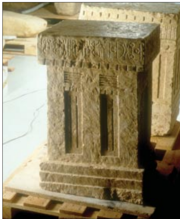
Altar 1, on which the name NHM was first identified, is currently on tour with the Queen of Sheba exhibit in Europe.

If in fact Nahom extended into this region in ancient times, this burial area now takes on special significance. The tombs date back as far as 3000 B.C., evidence of the large population in the area even earlier than the generally accepted dates of the Sabaean period, when Marib was at the height of its influence in the region. Could this unique site be the actual scene of “the place which was called Nahom”—the actual burial area referred to by Nephi?