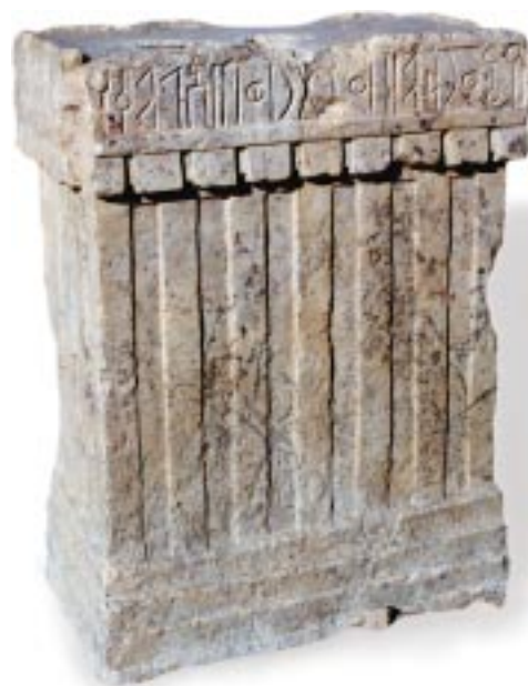
The second altar with the NHM name stands solitary in the forecourt of the Bar’an temple east of Marib. Right: A typical altar from the Bar’an temple.

two altars in an exhibit on ancient Yemen touring Europe since October 1997 and could no longer be examined at the Bar’an temple site. 5 Although a photograph of the altar appeared in the commemorative catalog accompanying the exhibit, the full engraved text—including the actual reference to Nihm—was not visible in the photograph, and readers had to be content with the translation provided in the catalog’s caption. Since then, however, two additional altars bearing the name Nihm have been identified at the same temple site.