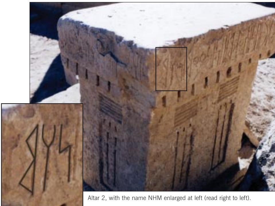
Altar 2, with the name NHM enlarged at left (read right to left).